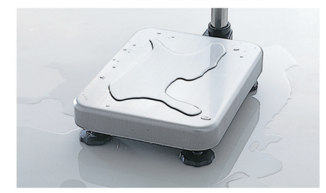
IP65 with SUS304

*1 Permits no ingress of dust and withstands water jetting from any direction.